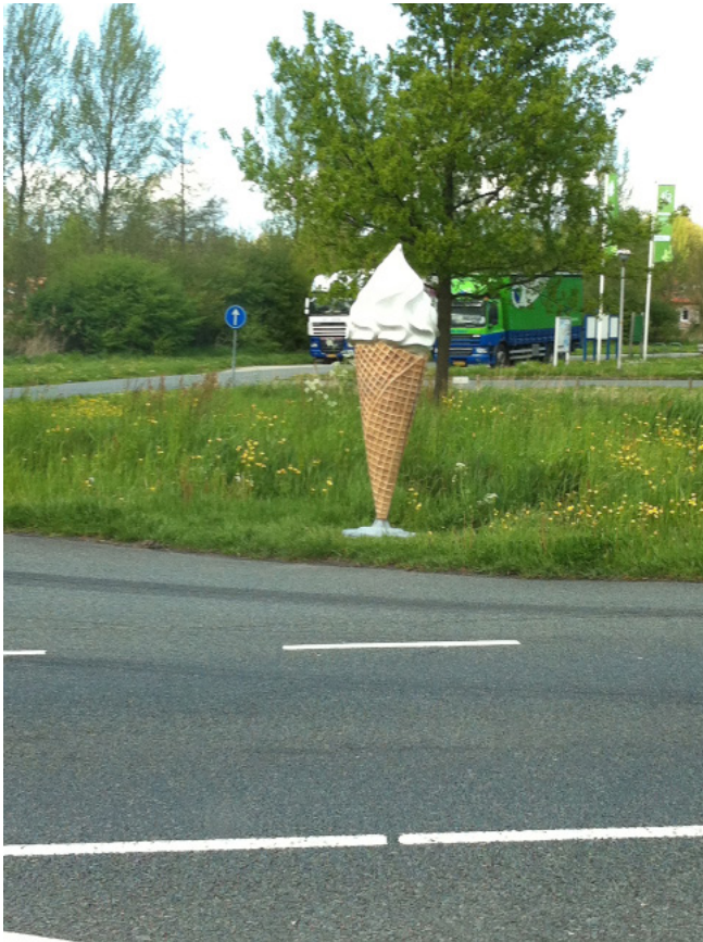
fibreglass Ice cream advertising roadside The Netherlands , sometimes also they also act as rubbish bins