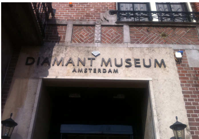
Diamond museum of Amsterdam