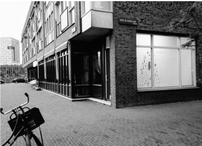
Achter de ramen