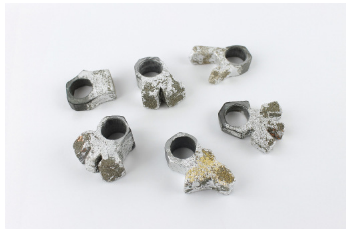
Manuka rings made in Amsterdam now at The National in Christchurch