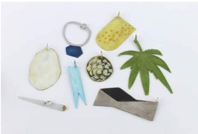
Pendants Made in Amsterdam, potato, joint, peg, ring, bitterballen, cheese, weed leaf, Architecture