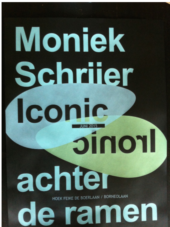
Poster for iconic ironic