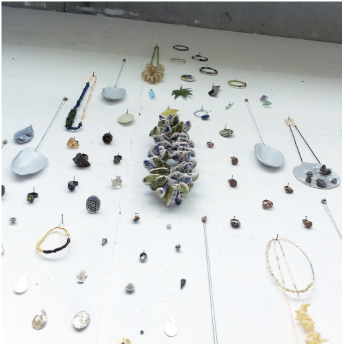
installation of Iconic Ironic in Achter de ramen near end of 2 month residency