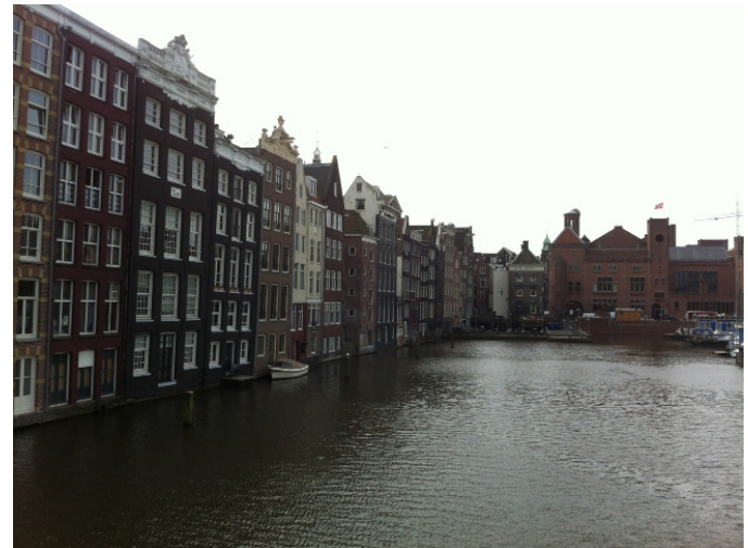
canal houses of Amsterdam