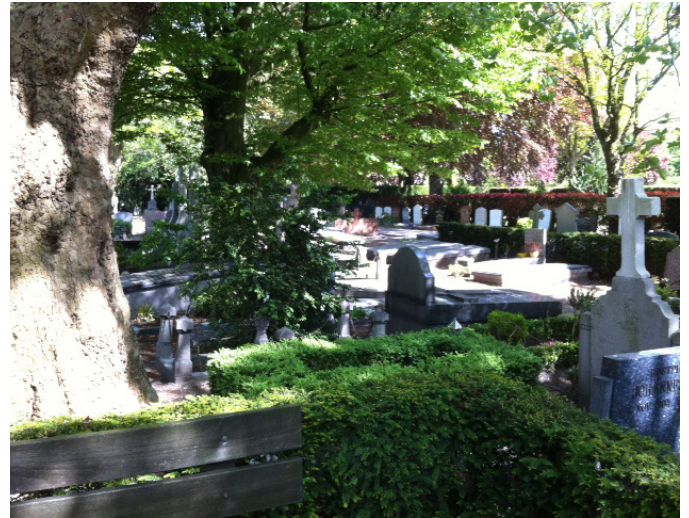
cemetery across from Reitveld Academy where I practiced my speech for my presentation at the academy