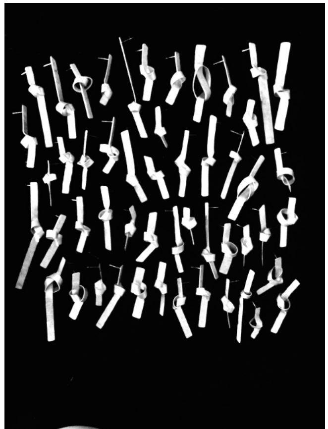
Knot earrings I made in Amsterdam