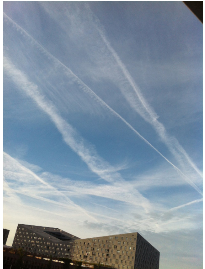
Architecture with contrails across the canal from studio Rian de Jong